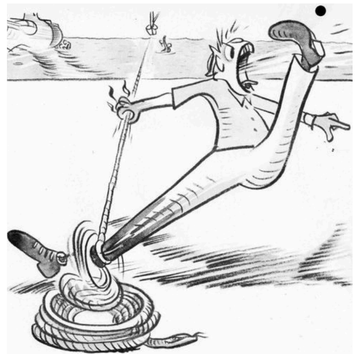
Keep your feet out of loose coils of line!

From the Archives: U.S. Navy training Dilbert cartoon with the caption "Keep your feet out of loose coils of line".